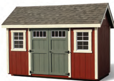
8' x 12' Patriot

There's a perfect garden structure for everyone