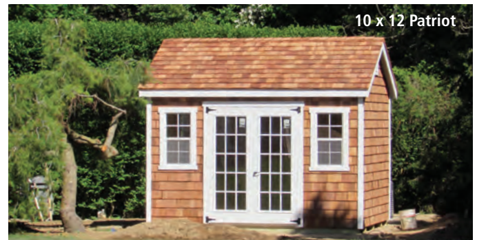
10 x 12 Patriot

Add a dormer, cedar shake roof or cedar siding.