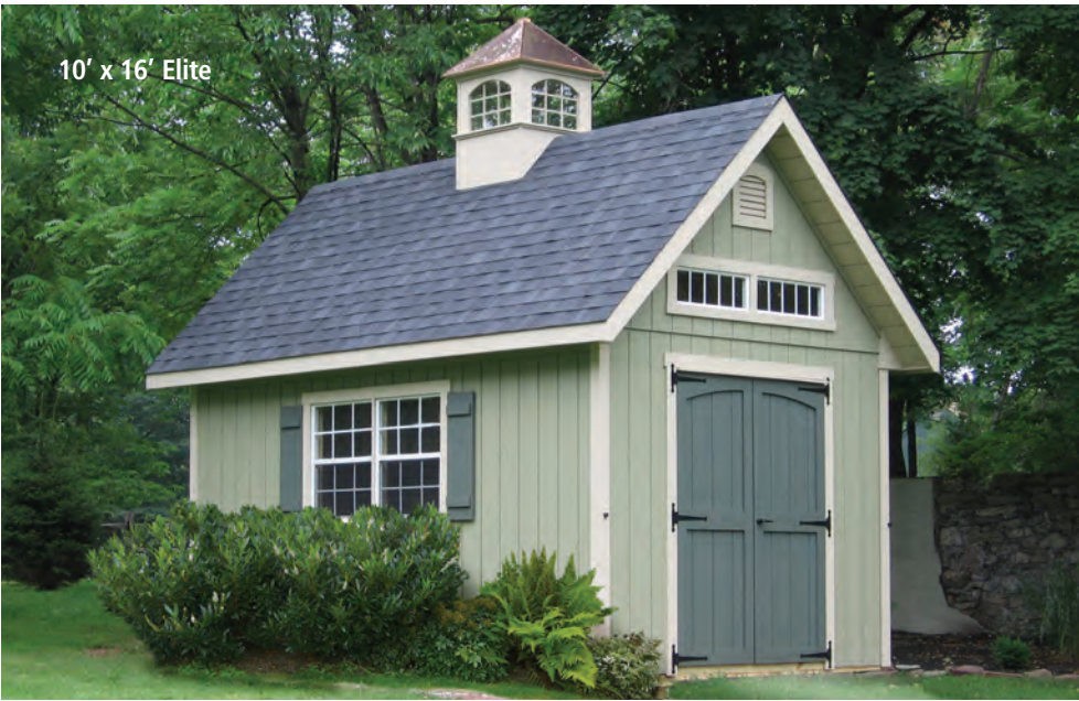
10' x 16' Elite

So well built, you can build a rustic cabin with our larger units