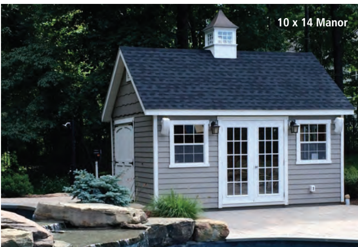
10 x 14 Manor

"With a place for all of the swim gear, now the kids actually enjoy tidying up. Most of the time."