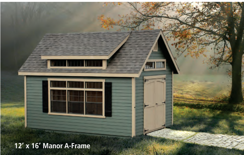
12' x 16' Manor A-Frame