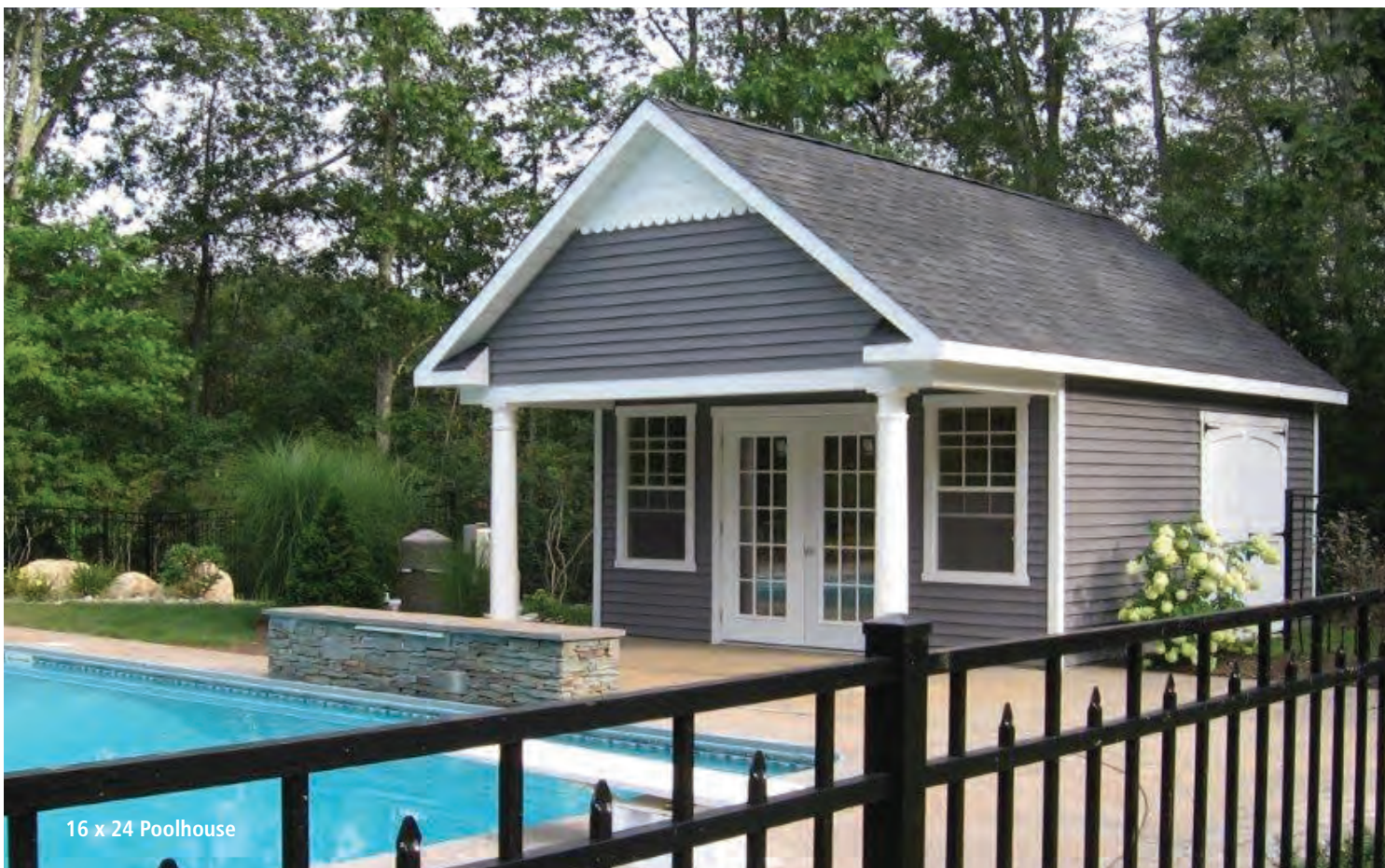
16 x 24 Poolhouse

Think of the ways your lifestyle can be enhanced with a poolhouse or other outdoor structure where you can relax and get away from it all. Read, nap, enjoy simply spending time in the quiet outdoors the way you always intended to.