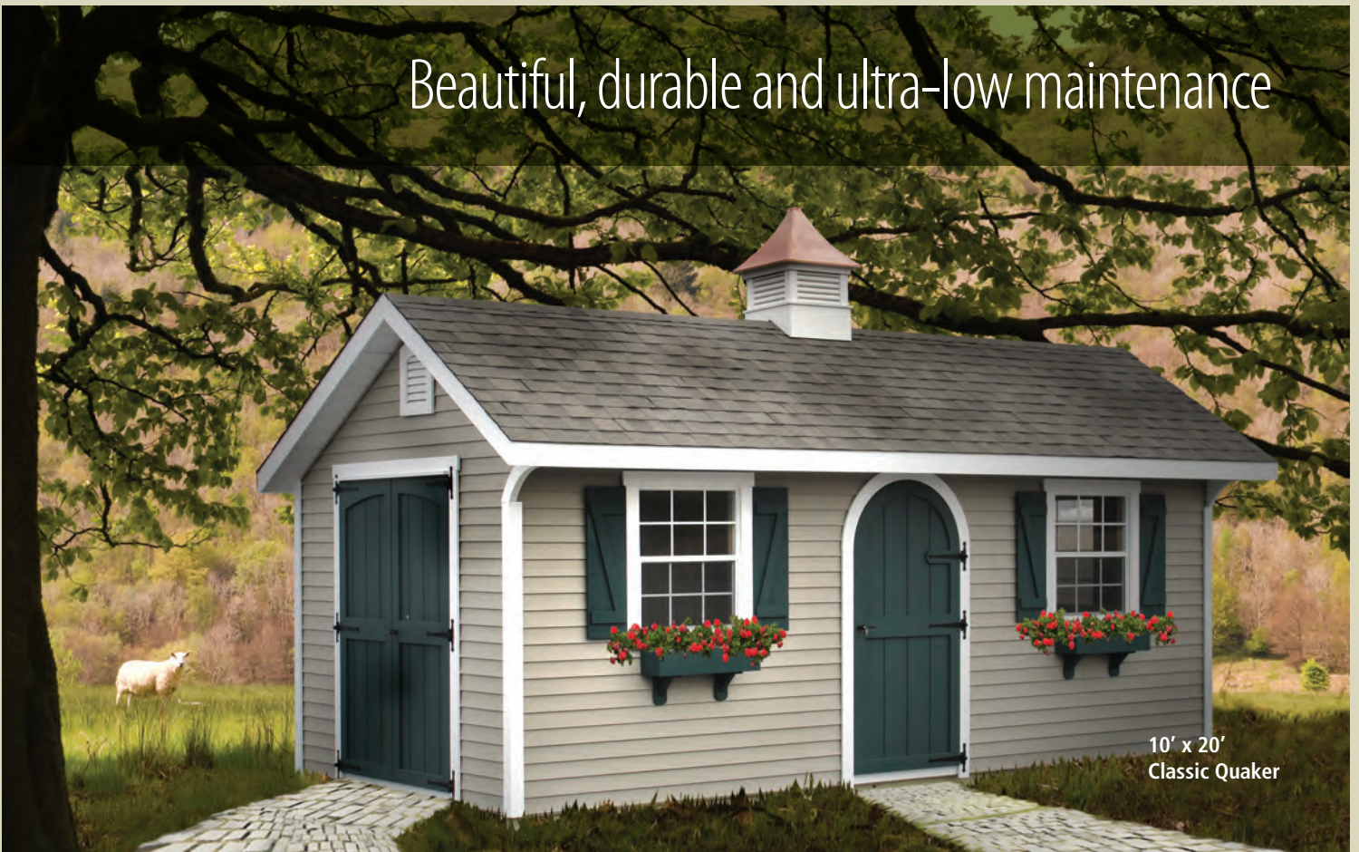
10' x 20' Classic Quaker

Beautiful, durable and ultra-low maintenance