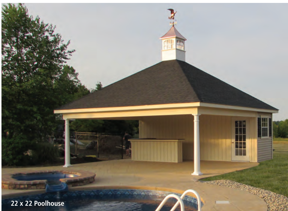
22 x 22 Poolhouse