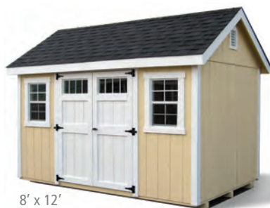
8' x 12' Patriot