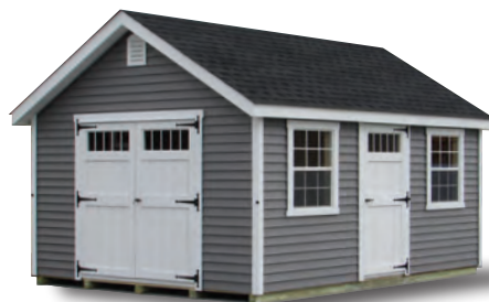
12 x 18 Classic