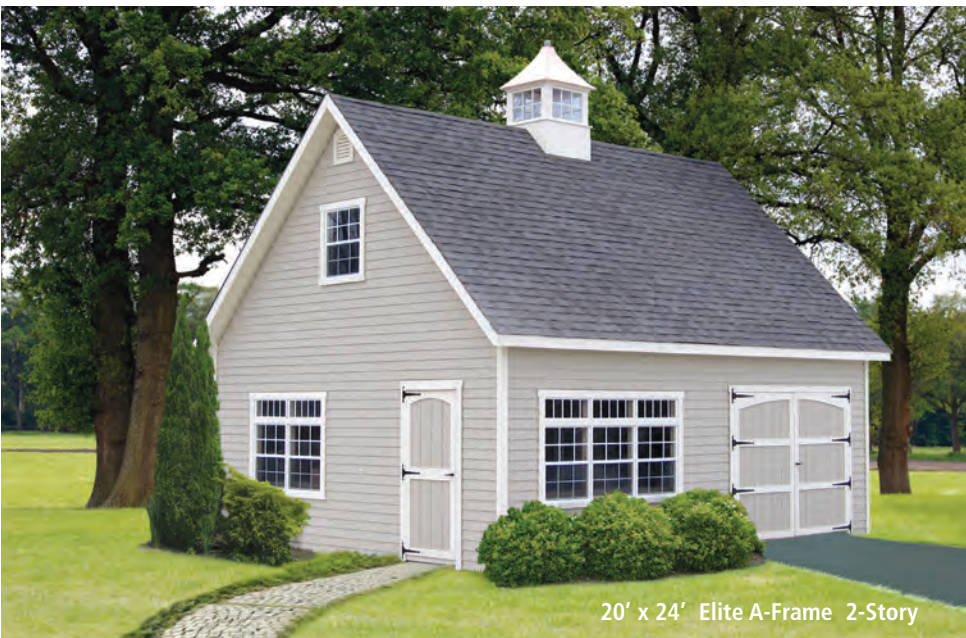
20' x 24' Elite A-Frame 2-Story