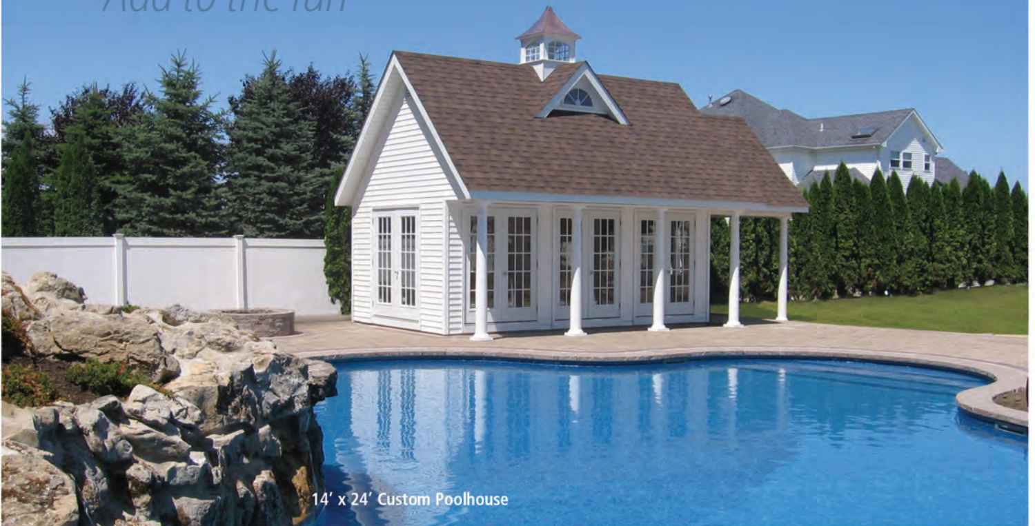
14' x 24' Custom Poolhouse