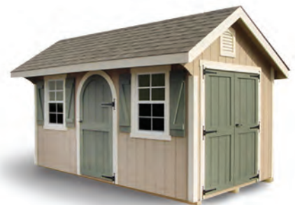
8' x 14' Quaker