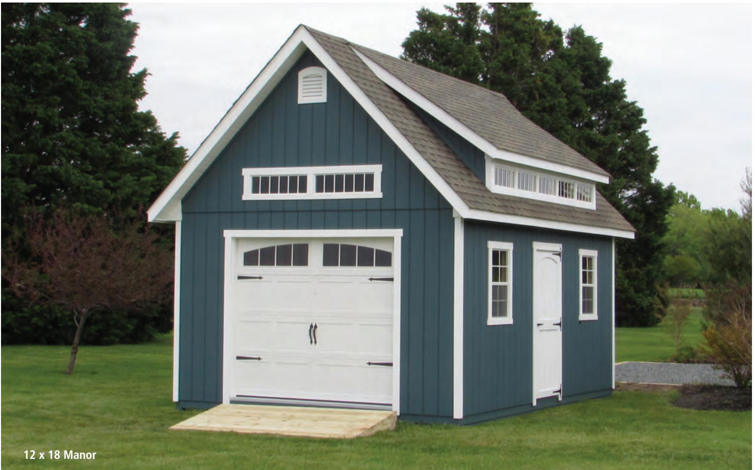
12 x 18 Manor