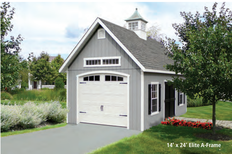
14' x 24' Elite A-Frame