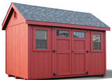
8' x 12' Patriot A-Frame