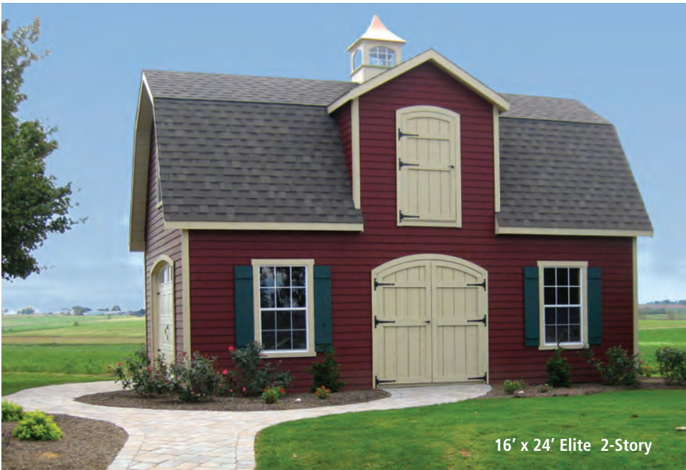
16' x 24' Elite 2-Story