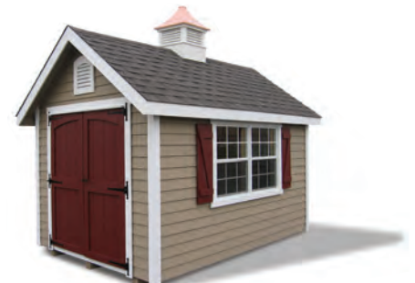
8' x 12' Classic Kountry