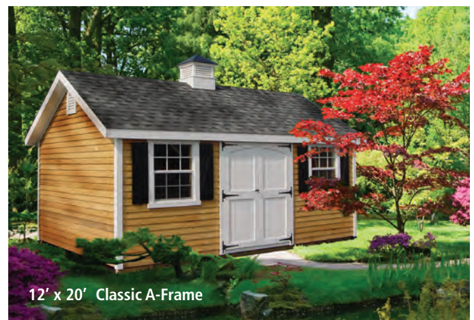
12' x 20' Classic A-Frame