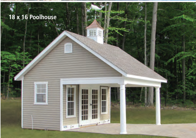
18 x 16 Poolhouse

"With a place for all of the swim gear, now the kids actually enjoy tidying up. Most of the time."